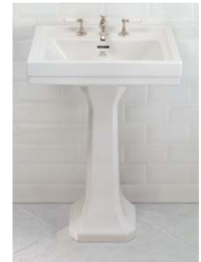
METROPOLE New York 1932 PAGE 22