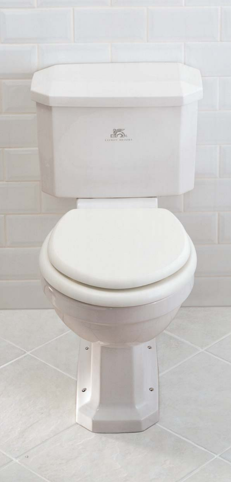
LEFROY BROOKS CLASSIC CLOSE COUPLED PAN LB 7207 AND CISTERN LB 7208 WITH CERAMIC LEVER LB 1307 AND WC SEAT LB 7241 W465 x D710 x H745mm