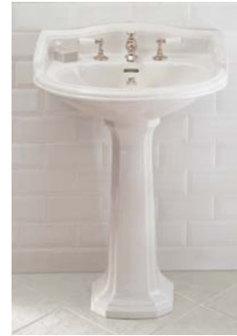
LISSA DOON Scotland 1870 PAGE 4