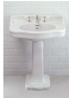
LA CHAPELLE Paris 1902 PAGE 14