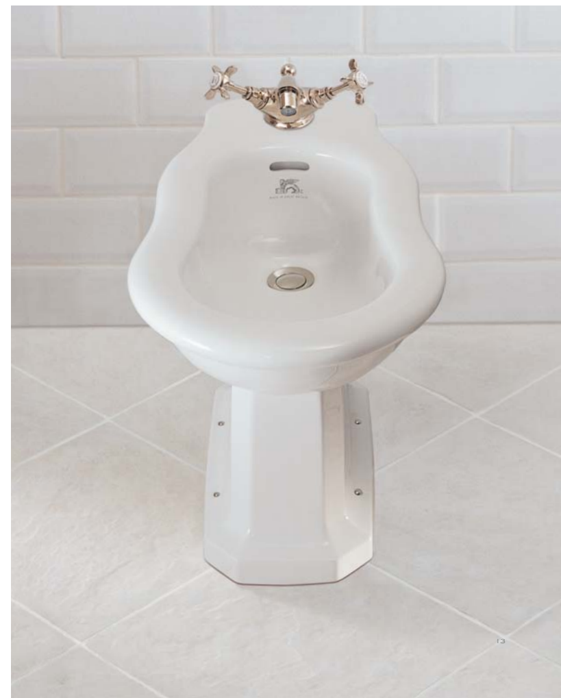
LEFROY BROOKS CLASSIC BIDET LB 7205 WITH MONOBLOC AND POP-UP WASTE LB 1199 W385 x D595 x H396mm

FINISHES - SILVER NICKEL, CHROME, ANTIQUE GOLD AND SATIN NICKEL.