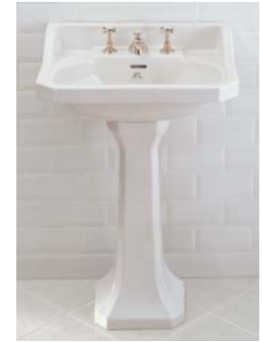
CHARTER HOUSE England 1918 PAGE 9